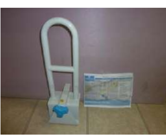
Bath safety rail