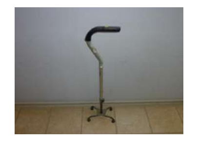
Height adjustable walking stick