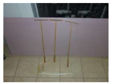
Playing card passers