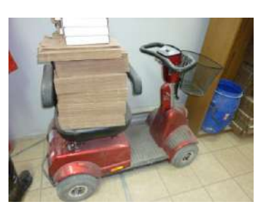
Fortress scooter NO LONGER AVAILA BLE