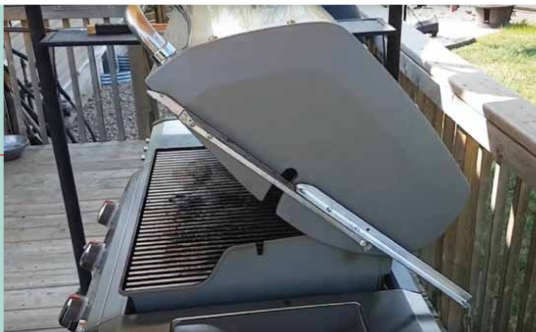
PHOTO: Voted "Most Liked Video" the bbq power lid was DESIGNED AND built by REGINA volunteer George Bliss

2019 awards recognize local Tetra volunteers. Visit tetraNation.org to view all submissions!