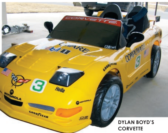
DYLAN BOYD'S CORVETTE